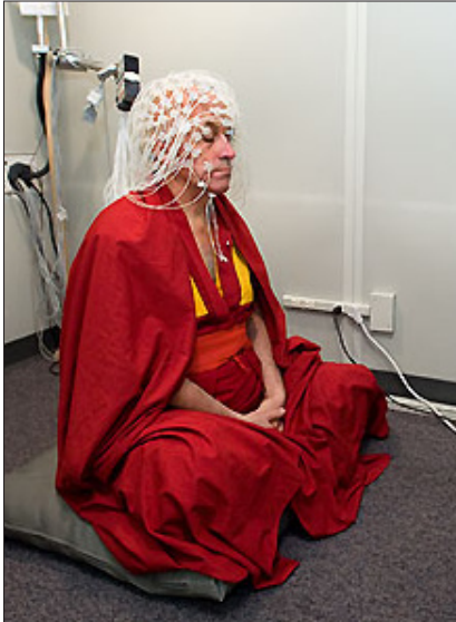
Buddhist Monk Matthieu Ricard at Waisman Center.